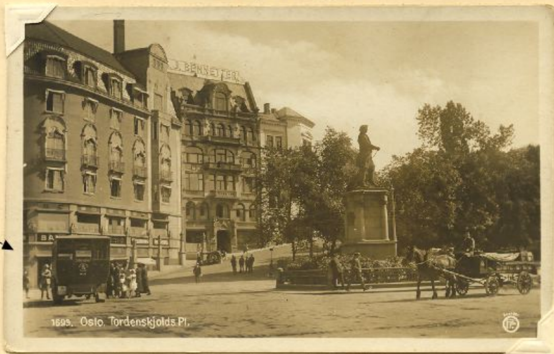
Old Schøyen bus